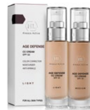
AGE DEFENSE CC CREAM

The above is a suggested home care program, for each individual client the professional will recommend the suitable products and the extent of the home care program based on the client's unique skin condition, lifestyle and benefits desired.